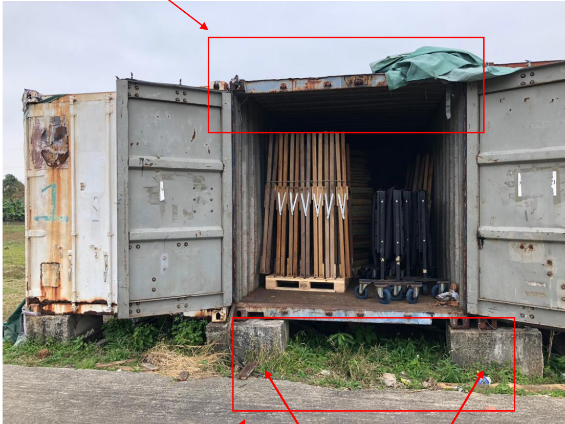
4 Concrete footings at each corners (柱)